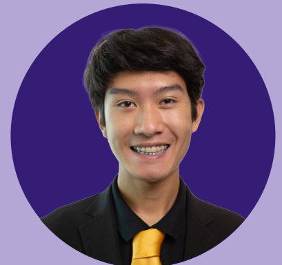
Division 44 West Lt. Governor Email: d44w.ltg@cnhkeyclub.org