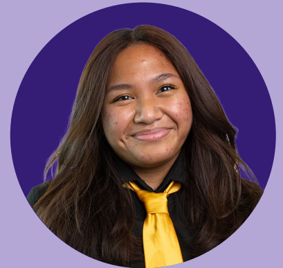
Division 28 South Lt. Governor Email: d28s.ltg@cnhkeyclub.org